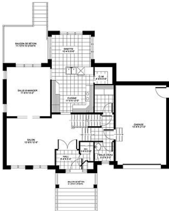
Rez-de-Chaussée Sup.: 941 pi 2 Garage : 330 pi 2